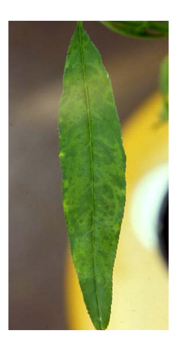
Web Fig. 4. Chlorotic rings and vein clearing caused by APLPV on European plum cv. President in greenhouse.