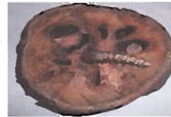
Citrus longhorned beetle ( Anoplophora chinensis )...can kill our valuable trees such as citrus, mulberry and oak