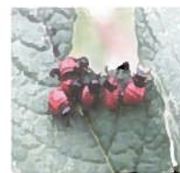
Colorado Potato Beetle... can destroy our potato crops.