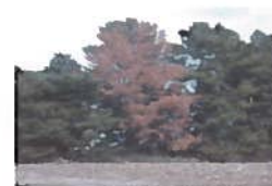
Pine Wood Nematode ( Bursaphelenchus xylophilus )... can destroy our pine trees