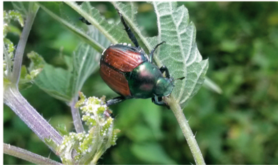
Popillia japonica - Japanese beetle