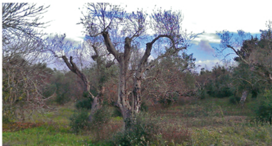
Xylella fastidiosa Olive quick decline syndrome