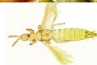
Melon thrips - Thrips palmi - Laurence Mound, ANDC, CSIRO.

IPPC - the International Plant Protection Convention - is an international agreement on plant health with 177 current signatories . It aims to protect cultivated and wild plants by preventing the introduction and spread of pests. The Secretariat of the IPPC is provided by the Food and Agriculture Organization of the United Nations . MORE