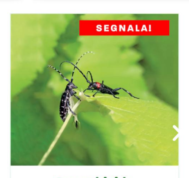
Cerambicide dal collo rosso