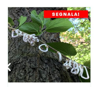
Cocciniglia dai filamenti cotonosi