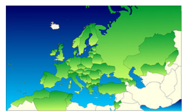
Current EPPO member countries are shown in green

The European and Mediterranean Plant Protection Organization (EPPO) is an intergovernmental organization responsible for international cooperation in plant protection in the European and Mediterranean region. In the sense of the article IX of the FAO International Plant Protection Convention (IPPC), it is the Regional Plant Protection Organization for Europe. Founded in 1951 with 15 member governments, it now has 52 member governments including nearly every country of Western and Eastern Europe and the Mediterranean region.