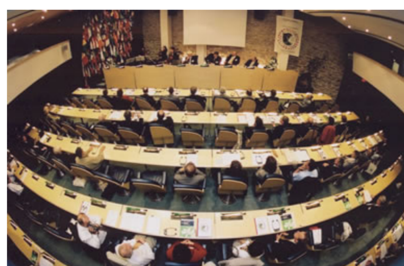
EPPO Council Session